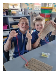
3/4F learning the 'running stitch' to sew fish!