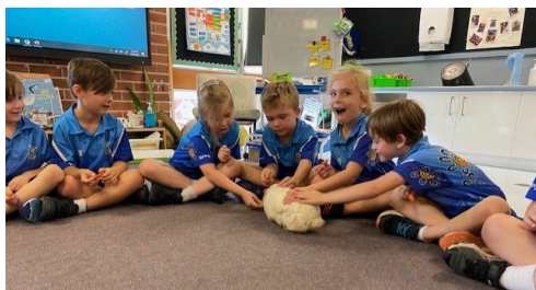
Easter Bunny comes to visit K/1S

If you are interested please contact the school for an information package or an online package can be viewed @ education.nsw.gov.au/oc