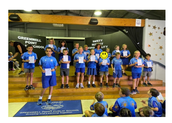
Assembly Awards & Leaders Awards