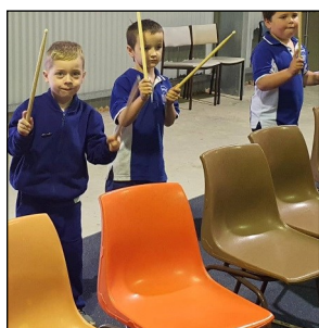
Chair drumming with K/1

What did you get up to over the weekend? Do anything exciting, email your picture to school.