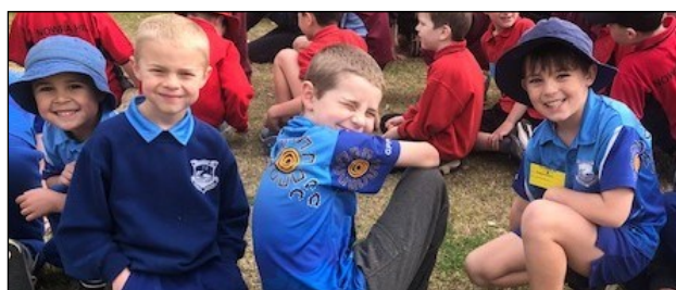
3-6 Athletics Carnival