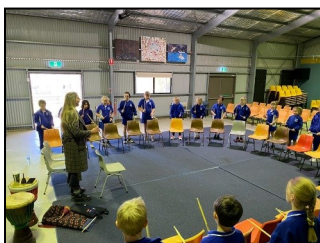
Music with 3/4/5

What did you get up to over the weekend? Do anything exciting, email your picture to school.