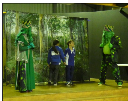
Environment play "The King & Queen of Green"