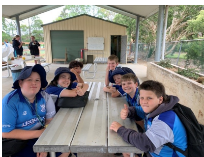
Year 6 enjoying Shoalhaven High Orientation last week.