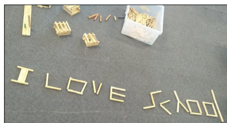
Maths games Year 3/4