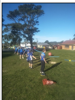
Activities around school this week.