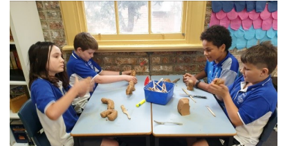
Year 2/3 working hard.