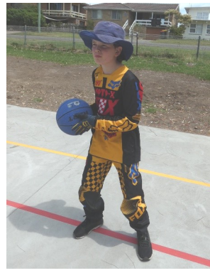
Sport's Mufti Day & basketball coaching classes