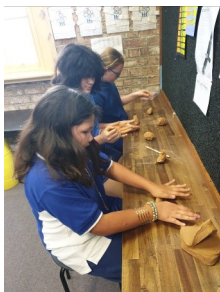
Visit from Shoalhaven High teaching pottery