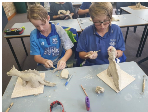
Clay art works.