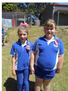
REMEMBRANCE DAY Left We Forget