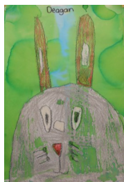
Art by: Deagan