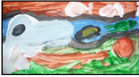
Art by: Travis McKay