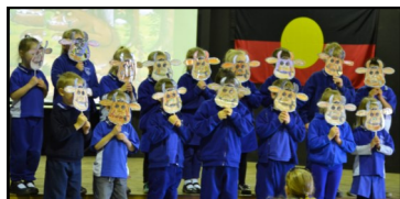
Our school's Open Morning for Education Week

Don't forget to collect your stickers when shopping at Woolworths, for every $10.00 spent that's a sticker, then attach them to your sheets. If you don't have a sheet or have filled it up just ask in the office for an extra sheets, then when your sheet is full with 60 stickers pop it into the box in the foyer at school. We now also have a collection box at Culburra.