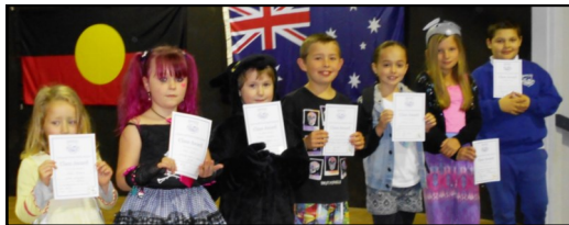
Students participating in Book Week 2015

Don't forget to collect your stickers when shopping at Woolworths, for every $10.00 spent that's a sticker, then attach them to your sheets. We now also have a collection box at Culburra Woolworths and at the Greenwell Point Black Marlin. This finishes on the 8th September.