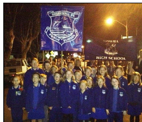
Students participating in the ANZAC Day Dawn Service