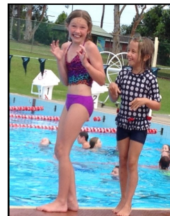
Students at the school swimming scheme