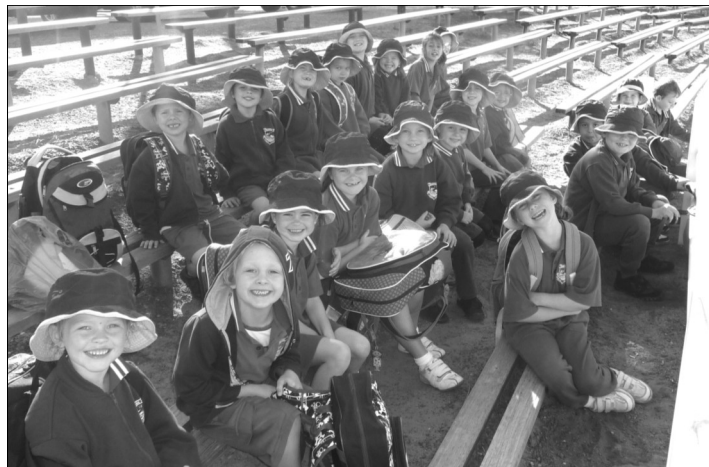
Kinder, Year 1 and Year 2 all enjoyed the AFL Gala Day held last Thursday.