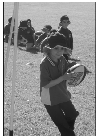
One of the K/1/2 AFL Gala Day activities.