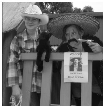
Students during Book Week and Literacy Week