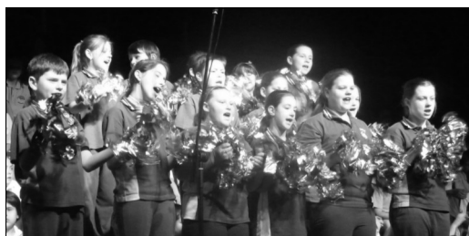
Our school choir at the recent Choral Festival at Nowra High School